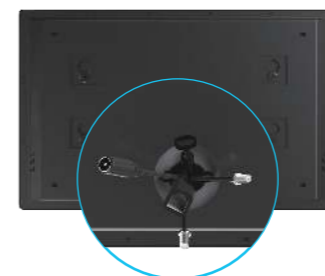
Multiple interface input